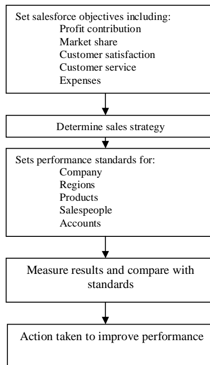
Figure 1 The salespeople evaluation process

Each of these decisions requires looking at a different set of evaluating criteria.